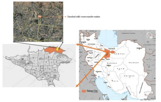
Figure 1. Location of Darabad solid waste transfer station in Tehran

Darabad solid waste transfer station selected for the present study, which is situated in District 1 of Municipality of Tehran. Darabad neighborhood is located in the northeast of the Tehran metropolitan, which is one of the largest cities in West Asia and is the 21st largest city in the world, with a population of 13,267,637 in 2016. It is located at 35.5044°N latitude and 51.2935 °E longitude (Figure 1). Darabad waste transfer station with the capacity of 1200 Tons waste the handling with area of 1.6 hectares was established in 2005 to reduce environmen tal issues related to waste transfer stations. The station is 56 kilometers from the Aradkouh final disposal site. The daily average of loading and unloading of waste in this station is 550 tons/day. Unfortunately, due to soil pollution, vegetation is not significant on this station.